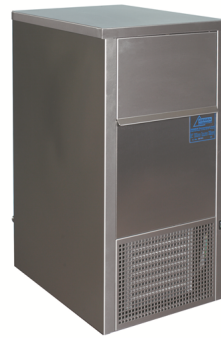
...in a sturdy stainless steel cabinet