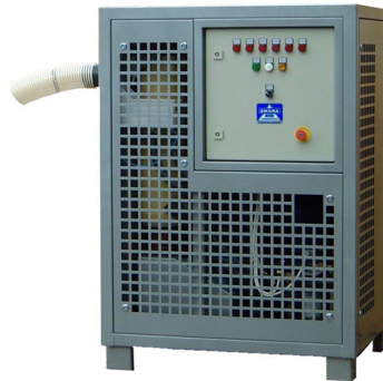
... in an industrial design.