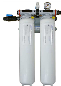
Cartridge waterfilter 180-2

Technical details: please see respective machine specification. With pleasure we submit to you any further information, also regarding your special requirements