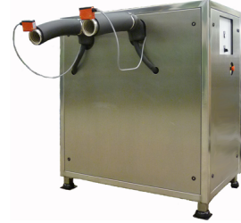
Ice maker with control system and stainless steel cabinet...